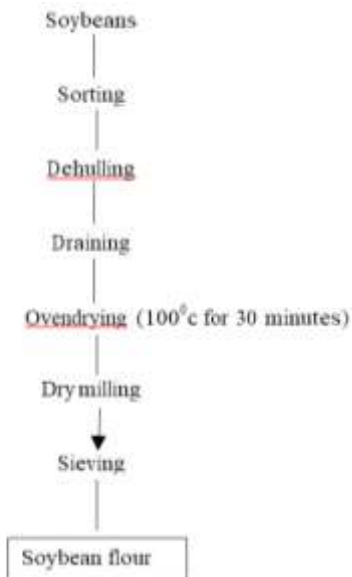
Fig2: flow chart for production of soybean flour

Soybeans was sorted to remove dirt and soaked for six hours after which it was dehulled. The dehulled grains were drained and oven dried at 100°C for 30 minutes. The dried soybeans was milled using attrition mill and sieved using a 0.5mm sieve to obtained soybean flour.